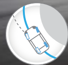
VEHICLE DYNAMIC CONTROL (VDC)

Seven sensors monitor driver inputs and vehicle motion, gently aiding the vehicle's ability to stay on the driver's intended path. Vehicle Dynamic Control helps control and limit both understeer and oversteer, maintains optimum traction and even applies brake pressure to reduce wheel slip on loose road surfaces.