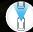
ELECTRONIC BRAKE FORCE DISTRIBUTION (EBD) WITH BRAKING ASSIST (BA)

Seven sensors monitor driver inputs and vehicle motion, gently aiding the vehicle's ability to stay on the driver's intended path. Vehicle Dynamic Control helps control and limit both understeer and oversteer, maintains optimum traction and even applies brake pressure to reduce wheel slip on loose road surfaces.