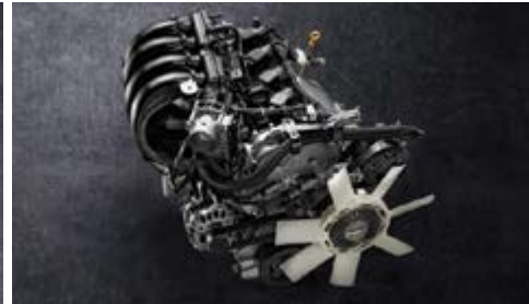
2.5L MULTIPOINT MANIFOLD INJECTION PETROL ENGINE

Choose between smooth petrol efficiency or turbo-charged diesel torque, across the Terra range. Various power output engines are now on offer in both petrol and diesel, to suit every leisure or business need. Combined with a 7-speed automatic or a 6-speed manual transmission, you'll be sure to have all the power to load, haul or cruise when you need it most.