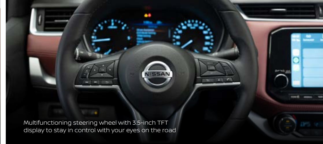
Multifunctioning steering wheel with 3.5-inch TFT display to stay in control with your eyes on the road

Embark on your daily adventures in unparalleled comfort. Expect a sleek driver cockpit and dashboard layout, with plush leather-appointed seats, and a leather stitched steering wheel and gear lever. Control all infotainment from the multifunction steering wheel and let NASA-inspired Zero Gravity front row seats assist in reducing fatigue on those longer journeys.