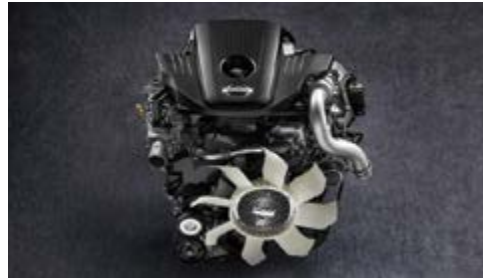
2.5L DDTI INTERCOOLED TURBO DIESEL ENGINE

The all-new Terra combines horse power and brain power in a way that gives you the confidence to conquer all rugged terrains, as well as the city streets and wide open roads. Purpose built for unique and unforgiving African conditions, this boldly styled and technologically advanced pickup arrives fully loaded with features to keep you and your loved ones connected, safe and comfortable, no matter where the road takes you.